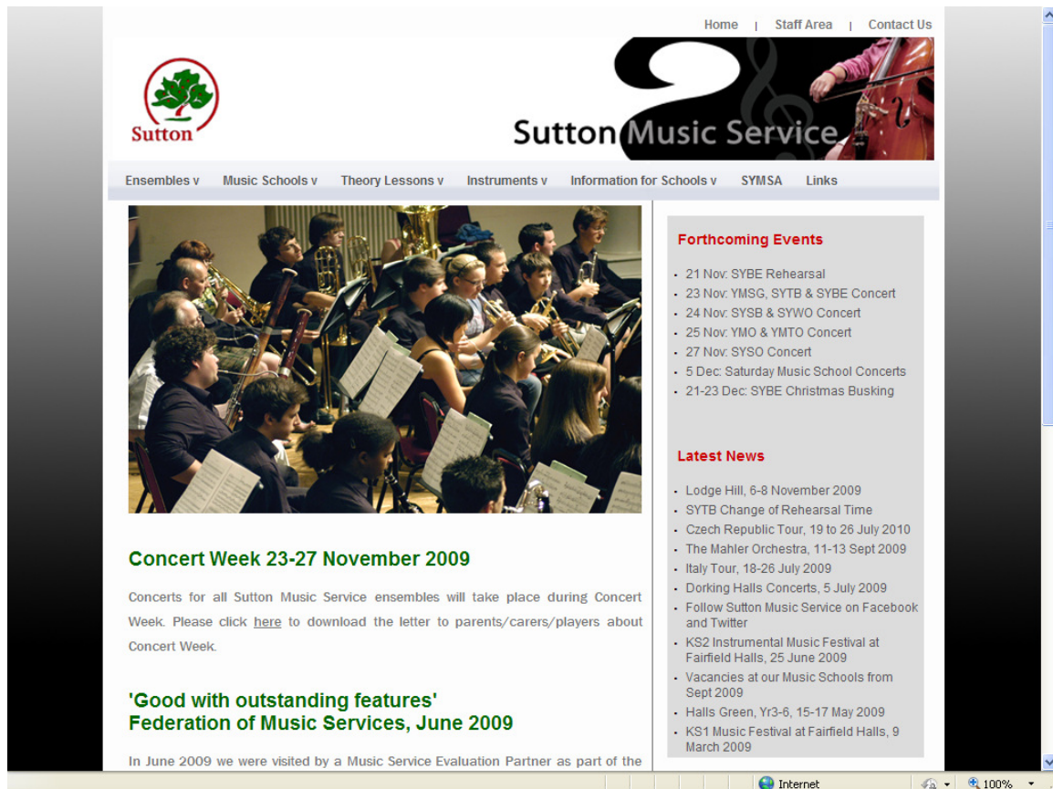
Website home page

During the year, the website was developed to include a password protected staff area which allows staff to access a wide range of relevant information and documents.