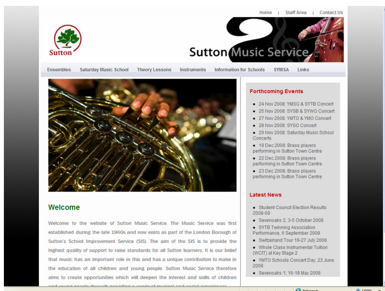
Website home page

The Music Service website, www.suttonmusicservice.org.uk was launched on 15 th May 2008, since when it has received 5,496 visits from 2,153 unique visitors. On average, the website is visited 29 times a day for around five and a half minutes per visit. The website includes information for pupils, parents/carers, staff and schools on all aspects of the work of the Music Service.